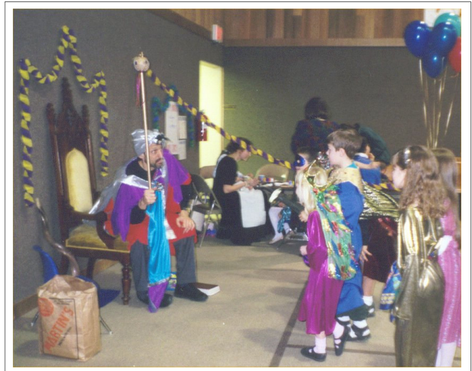
Dressing up as characters from the Book of Esther is a traditional part of a Purim celebration

The revelation may have come as a result of spending a larger percentage of our time buying and opening gifts rather than studying the Scriptures about the birth, circumcision and dedication of Yeshua and the purification in the Temple in