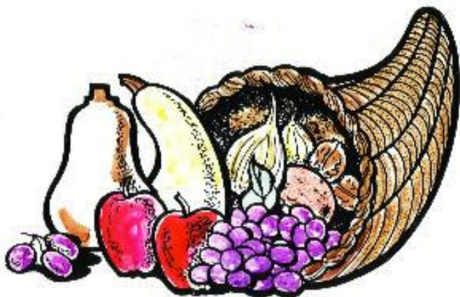
Jews all over the world observe Shavuot as a feast celebrating the harvest season

The outpouring of God's Holy Spirit took place on Shavuot, I believe, because it was God's call to unify the Jews and the Gentiles in Messiah. When religious Jews celebrate Shavuot, they read from the Book of Ruth. Get it! Ruth, the Gentile woman who said to her Jewish mother-in-law, "Your God will be my God." The same woman who is in the line of both King David and Jesus the Messiah. Without knowing it, Jewish people are celebrating that unity at Shavuot. And the Church, generally equally unknowing, is doing it too. Our job is to help make both sides aware of this truth so the power of the Holy Spirit can do its work, unifying Jews and Gentiles in Yeshua!