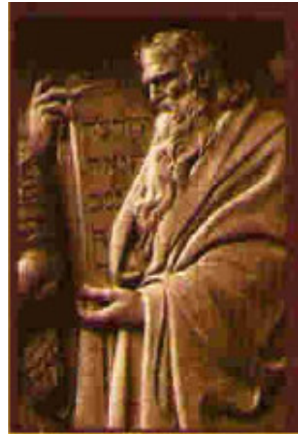
Shavuot is traditionally regarded as the day when Moses received the Commandments

But it was fifty days later the Lord commanded the next feast to be held, from which we derive the feast's Greek name, "Pentecost." The Hebrew name for this feast (remember it was ordained by God some 1400 years